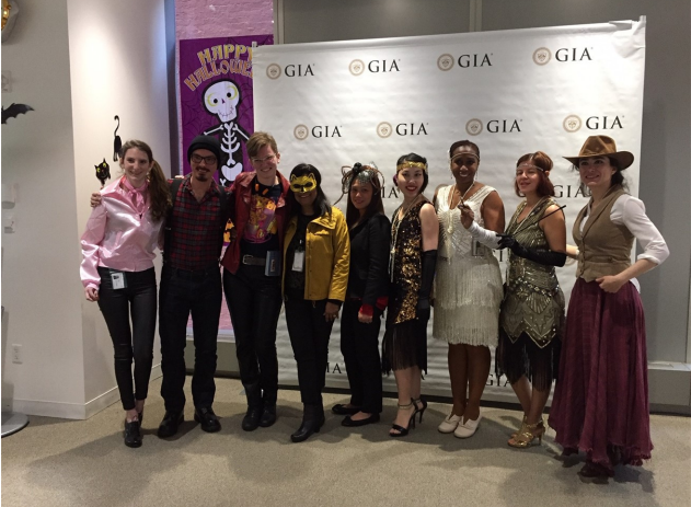
Top - GIA's New York campus is located in the International Gem Tower (IGT)/ Bottom - Students celebrate Halloween