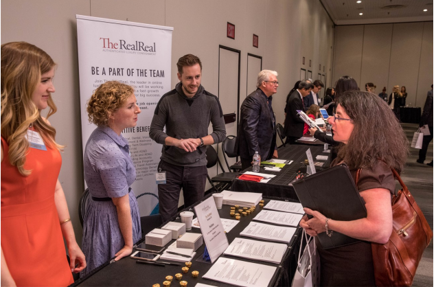
Annual Career Fairs provide students with the opportunity to meet with employers hiring for open positions.